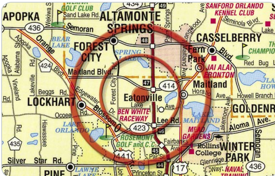
According to the U.S. Dept. of Commerce, the average business draws 80% of its customers from within a three mile radius. 95% are located within five miles.